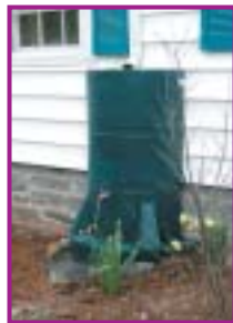
A rain barrel in one of the Master Gardener Program's gardens.

through one field test in Old Saybrook, the feedback from which resulted in significant improvements (thanks, Saybrook NEMO Task Force). The new and improved version will be available to towns within the coastal zone management area by the end of the summer. As to the “multi-media” aspect: the presentation will be accompanied by a short series of fact sheets, and complemented by a website that will take visitors through a coastal resource inventory tutorial, provide interactive mapping to access the latest and best available habitat maps and link to additional publications and resources. ☀