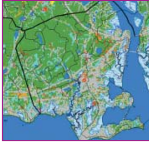
Draft map from Focus on the Coast website (see page 1), showing growth in urban land in Old Saybrook. Gray depicts areas developed before 1985. Red, orange and yellow depict urban growth from 1985-1990, 1990-1995 and 1995-2002, respectfully.