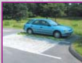
(top to bottom) Permeable parking stalls; Green roof installations; rain garden installation.

Rain Barrels: Another long-established technique is being used for other parts of the Center roof. Rain barrels, connected to the roof downspouts, capture the relatively clean roof runoff and retain it for