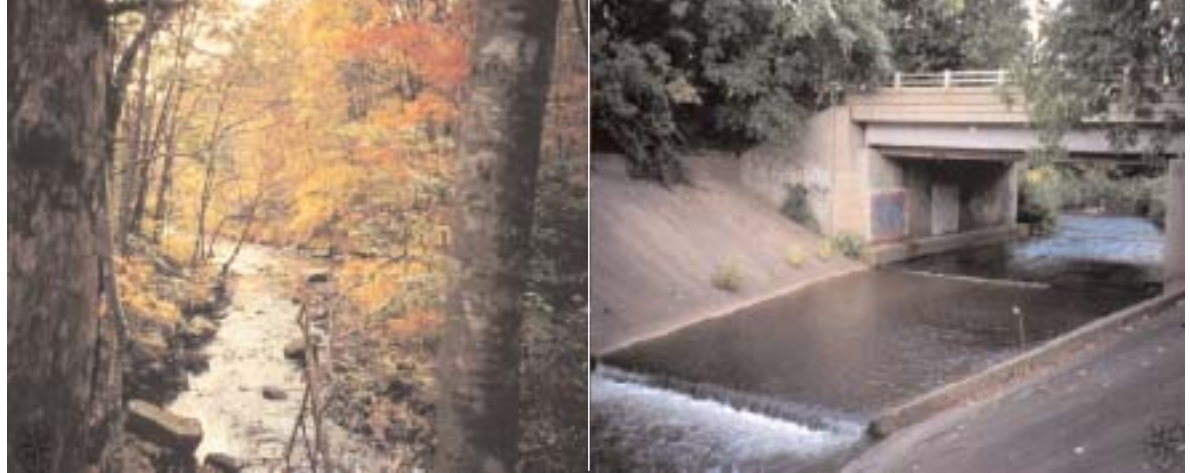
Figure 2. Changes in stream form associated with urbanization.

When increased pollution is added, the combination can be devastating. In fact, many studies are finding a direct relationship between the intensity of development in an area - as indicated by the amount of impervious surfaces - and the degree of degradation of its streams (Figure 3). These studies suggest that aquatic biological systems begin to degrade at impervious levels of 12% to 15%, or at even lower levels for particularly sensitive streams. As the percentage of imperviousness climbs above these levels, degradation tends to increase accordingly.